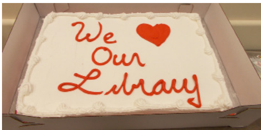
Thank you for supporting the East Greenbush Community Library