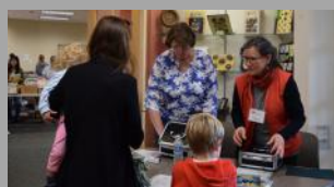
Children's Festival volunteers