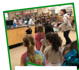
Library card day