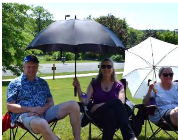
Pen to Pandemic Reception