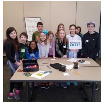
Ventriloquism Show with the Magic Trunk