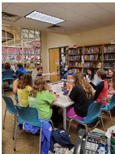
Teens played Jenga and card games at Friday Mashup.