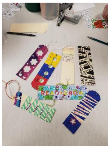
The Teen Volunteer (TV) Club made bookmarks promoting kindness to place in random library books.