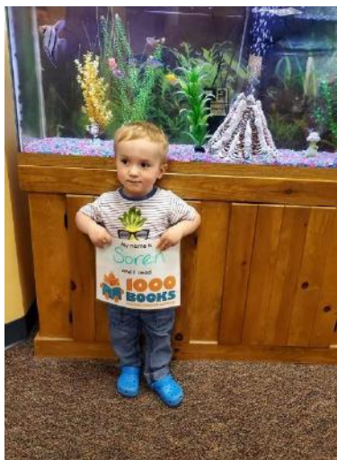
Soren finished reading 1000 books!