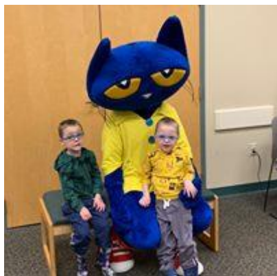
Pete the Cat makes a guest appearance at our 1000 Books Before Kindergarten Party!

24 new children registered for the 1000 Books Before Kindergarten program this April. There were 31 check-ins this month to record another 100 books read, and two children finished the program! We also held our annual 1000 Books Party on April 13 th , and this year's graduates of the program were honored. The highlight of the event was a special appearance by Pete the Cat.