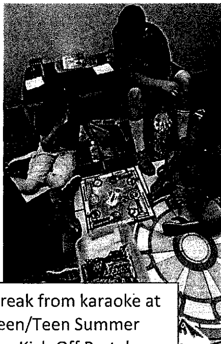
Taking a break from karaoke at the Tween/Teen Summer Reading Kick-Off Party!