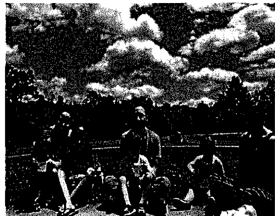
Ice cream at the Summer Reading Kick-Off!