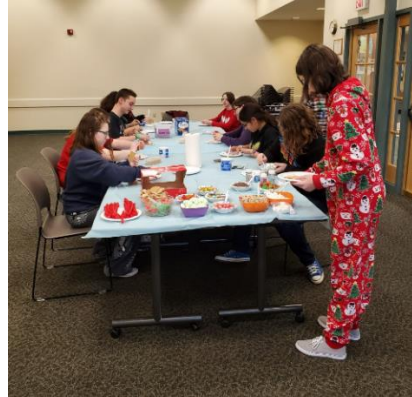
Friday Mashup: Gingerbread house edition