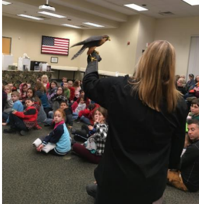
Silent Wings: Birds of Prey

518-477-7476 | www.eastgreenbushlibrary.org