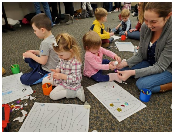
Rocking Noon Year @ your library!